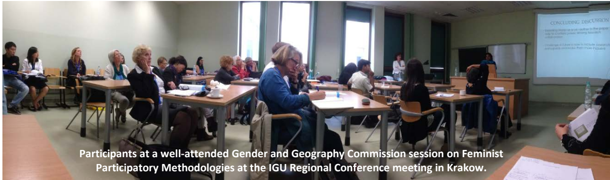
Participants at a well-attended Gender and Geography Commission session on Feminist Participatory Methodologies at the IGU Regional Conference meeting in Krakow.