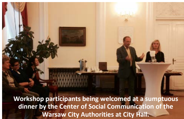
Workshop participants being welcomed at a sumptuous dinner by the Center of Social Communication of the Warsaw City Authorities at City Hall.