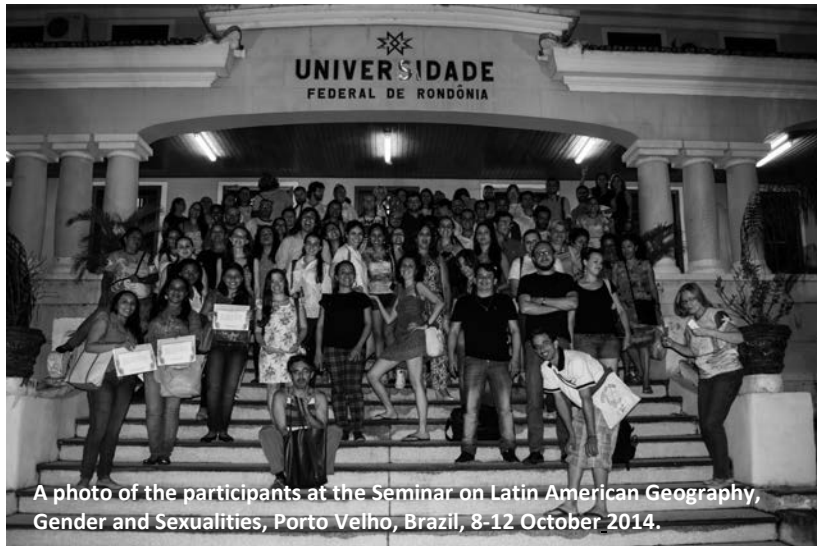
A photo of the participants at the Seminar on Latin American Geography, Gender and Sexualities, Porto Velho, Brazil, 8-12 October 2014.