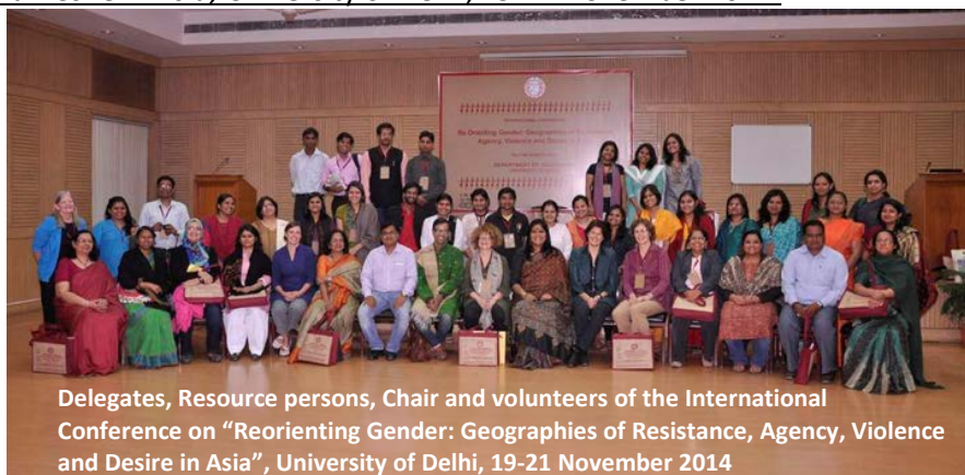
Delegates, Resource persons, Chair and volunteers of the International Conference on “Reorienting Gender: Geographies of Resistance, Agency, Violence and Desire in Asia”, University of Delhi, 19-21 November 2014