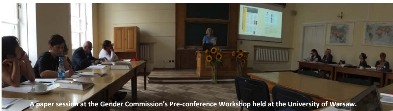
A paper session at the Gender Commission's Pre-conference Workshop held at the University of Warsaw.